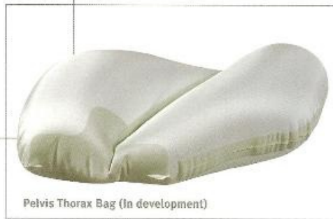
Pelvis Thorax Bag (In development)