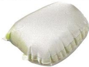
Tested Thorax Bag